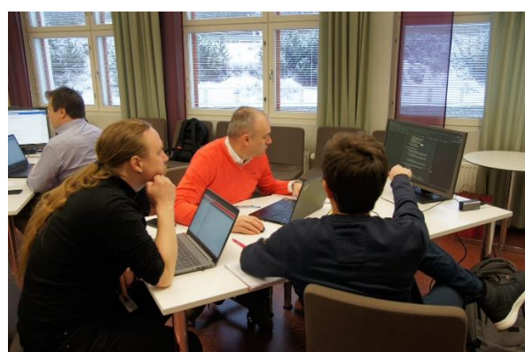
Fig. 2. Workshops - international co-teaching teams in action during the 2 nd day of the WP2 Tailored Training Seminar.