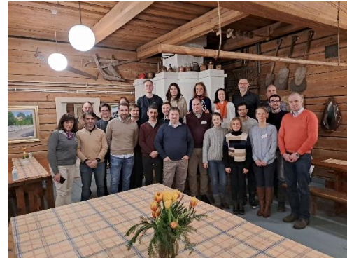
Fig. 3. Group pictures of NextGEng partners during the Training Seminar.

The training seminar promoted and expanded participants' thinking of learning and student-centred pedagogies. Moreover, contemplated participants mindsets towards learning and co-teaching. During these two days, all teacher of six co-teaching courses had the possibility to discuss and share their thoughts and plan the next steps. This seminar helps partners to continue valuable work in this project.