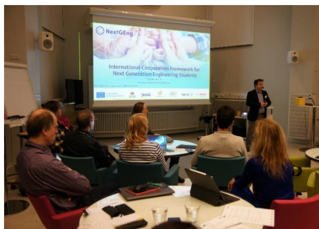
Fig. 1. Activities during the WP2 Tailored Training Seminar.